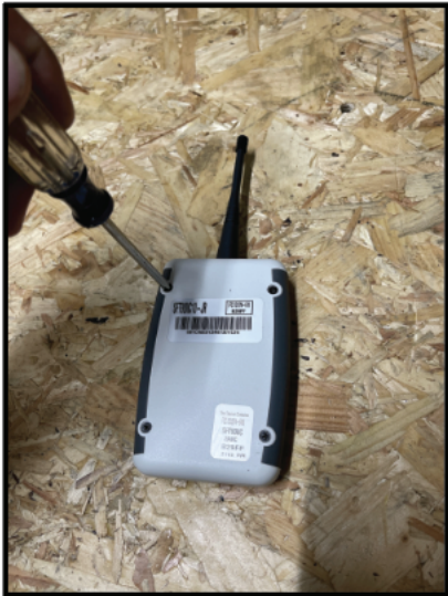
step 1: remove transmitter cover

***power must be on (red light visible on receiver) for learn process