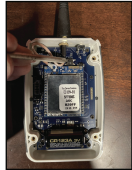
step 4: press 'learn' on transmitter