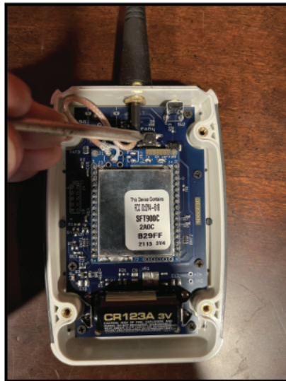
step 2: press 'learn' on transmitter